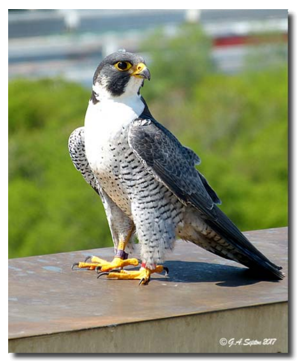
Above : Hercules at his nest box. Left : The three young on banding day.

This site has been active since 2002, producing a total of 34 young (2.13/year).