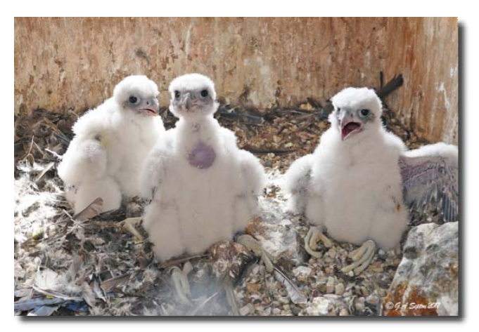
The three youngsters after banding.

Eggs: 3 laid between April 16-23 Projected hatch dates: May 23-25 Eggs hatched: 3 between May 23-24 Banded: 3 males on June 11 Site visits: June 11