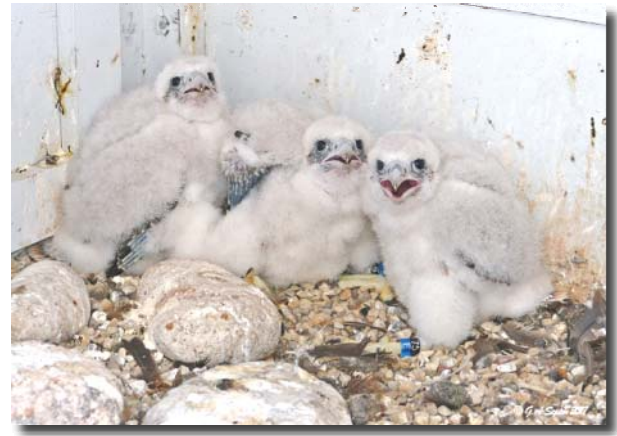
Brinn (top) and three young on banding day.