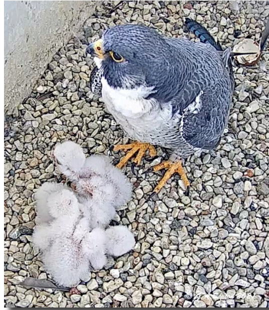
Above: Hercules and his three young.

This site has been active since 2002, producing a total of 45 young (2.25/year).