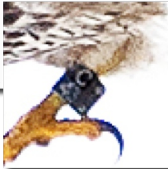
“Blaze” (b/blu) C/43 , a male produced in 2020 at We Energies Valley Power Plant nest site in Milwaukee , was photographed May 10, 2021, at Kletzsch Park in Milwaukee.