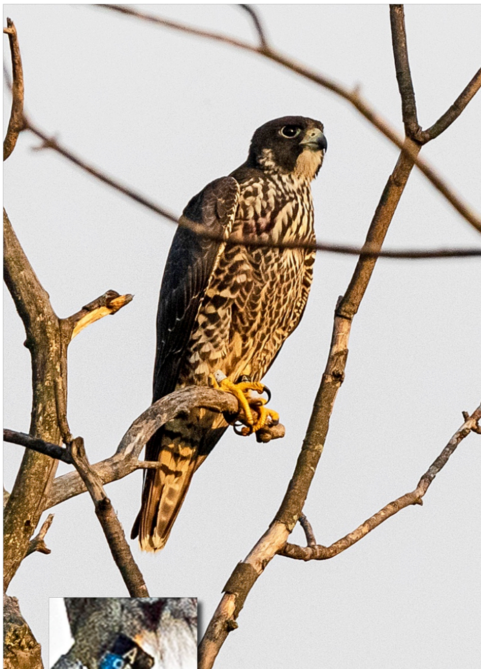
“Fauci” (b/blu) A/95 , a male produced in 2021 at We Energies Oak Creek Power Plant in Oak Creek, Wisconsin, was photographed Sept. 7, 2021 at McDowell Grove Forest Preserve in Du Page County, Illinois.