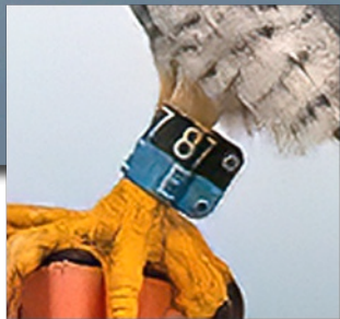
Above: “Labo” (b/blu) 87/E , a male produced in 2017 at We Energies Presque Isle Power Plant in Marquette, Michigan. Labo was photographed along with two other peregrines at Cat Island in Howard, Wisconsin, Aug. 26, 2021.