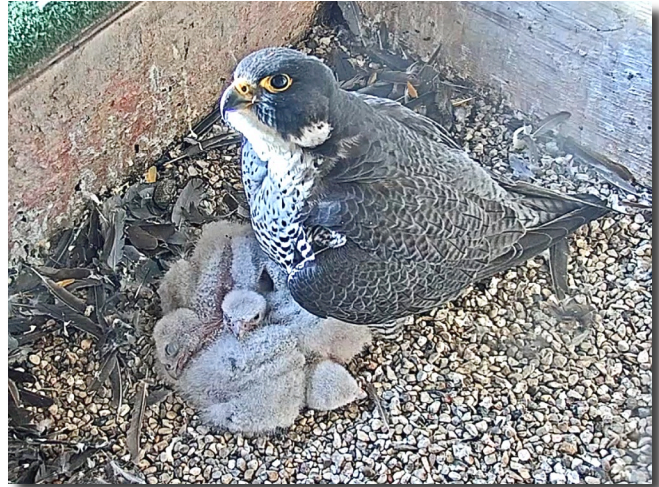
Above: Essity standing guard over her youngsters.

Adult Male: “Michael” (b/r) P/58 , produced in 2015 at the Racine County Courthouse nest site in Racine, Wisconsin – back for his fifth year.