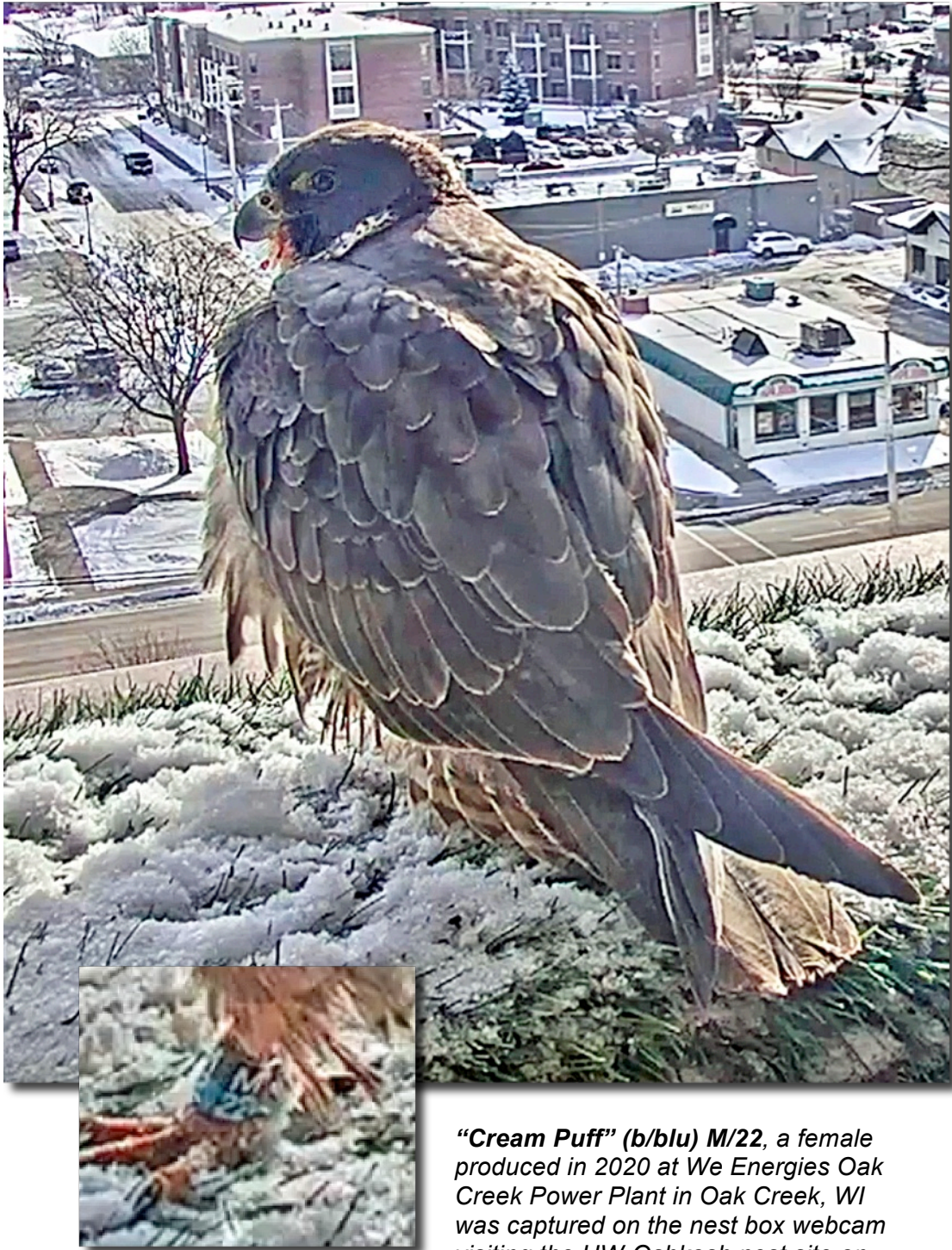
“Cream Puff” (b/blu) M/22, a female produced in 2020 at We Energies Oak Creek Power Plant in Oak Creek, WI was captured on the nest box webcam visiting the UW-Oshkosh nest site on January 25, 2021.